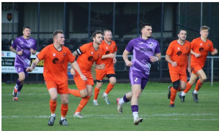
Action shots from Shepton Mallet game